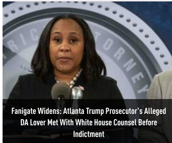
Fanigate Widens: Atlanta Trump Prosecutor's Alleged DA Lover Met With White House Counsel Before Indictment