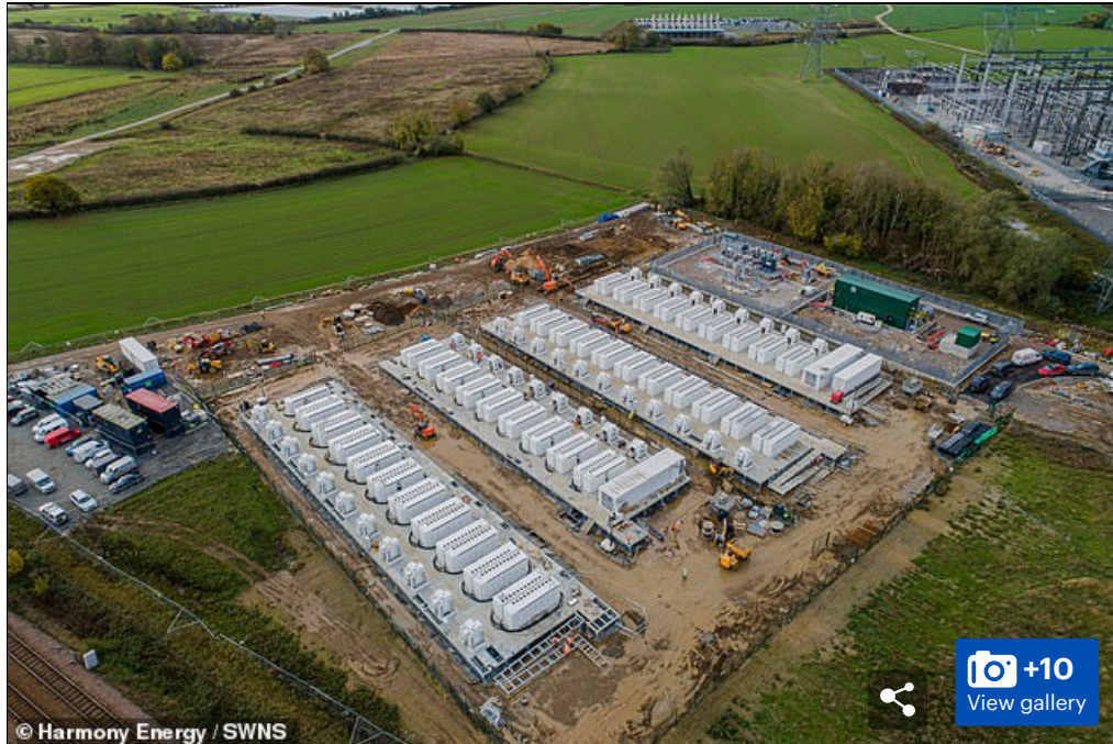
The fire comes amid proposals in the UK to build one of Europe's largest battery storage sites in Buckinghamshire has been met with fierce criticism