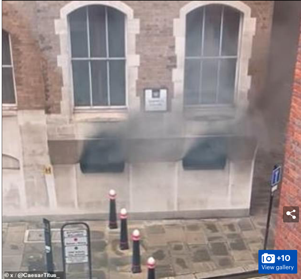
Fire crews had to check out 'multiple buildings' on Warwick Lane

battery failure earlier this month. Member of the legal profession are seen outside the Old Bailey amid the incident