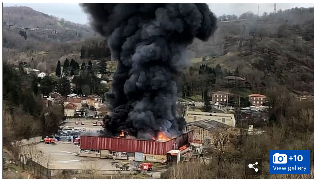
A warehouse storing 900 tons of lithium batteries waiting to be recycled went up in flames this afternoon, amid growing fears over their dangers

The fire in France has once again raised questions around the use and safety concerning the batteries.