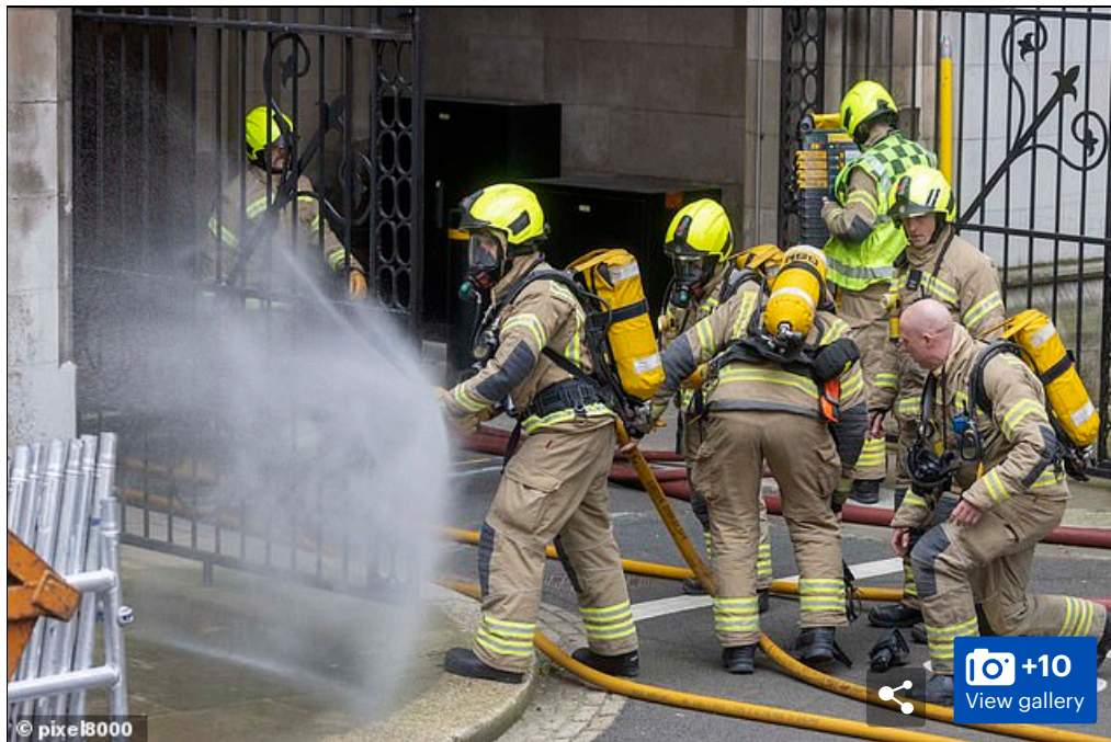
Firefighters with specialist gear (pictured) from three fire engines rushed to battle the blaze