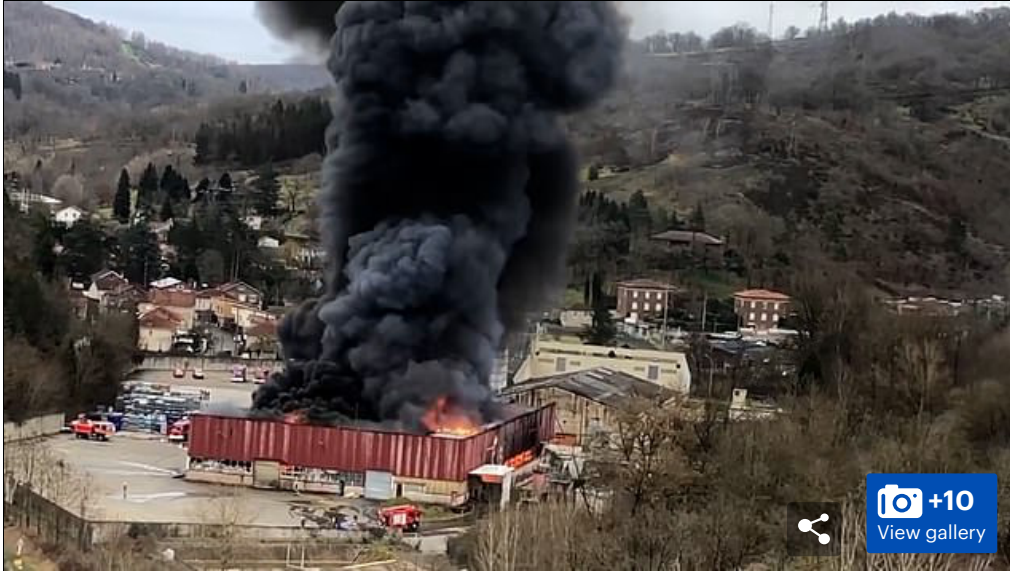
The fire in France occurred at a storehouse in the town on Viviez in Aveyron, and residents were told to stay indoors by authorities