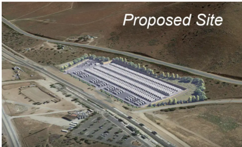
The proposed site of an Acton battery energy storage system near Angeles National Forest Highway.

@ PERRY SMITH(HTTPS://SIGNALSCV.COM/AUTHOR/PERRYSMITH/) 📅 OCTOBER 12, 2023 ⌚ 3:43 PM