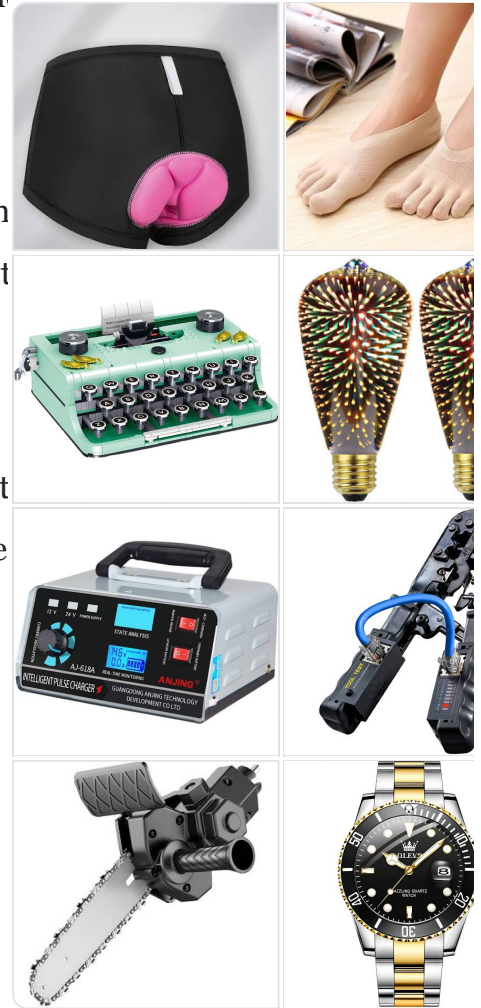
Big discount on Temu Temu

The initiative comes amid increasing concerns over the unintended consequences electric vehicles may have on the environment. According to the Foundation for Economic Education, only about 5% of lithium-ion batteries are recyclable, compared to the 90% of batteries in conventional cars.