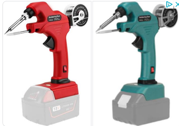
Big discount on Temu Temu

Biden and his administration appear determined to effectively mandate electric vehicles throughout the country over the next several years, leading some to question the actual effectiveness of EV’s in aiding the environment.