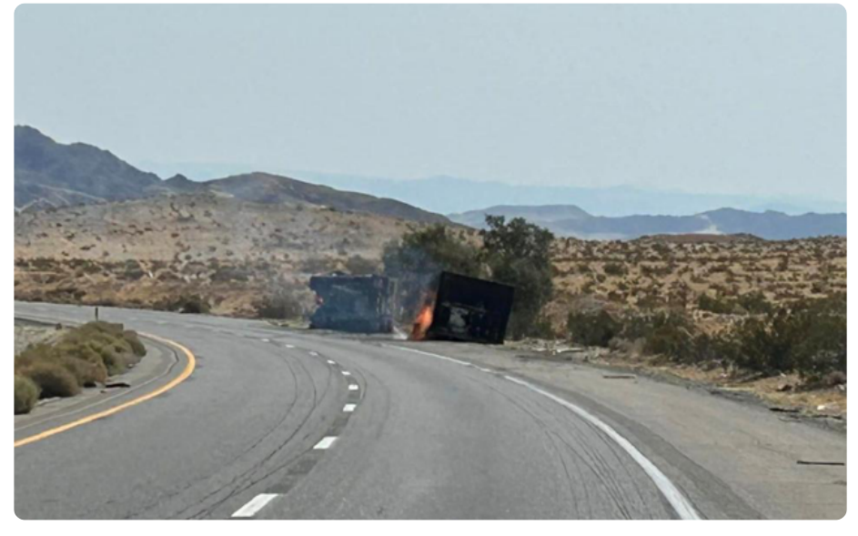
A big rig hauling lithium-ion batteries overturned and caught fire, prompting a full closure of the 15 Freeway between Barstow and Baker on Friday, July 26, 2024.

In addition to the possibility of thermal runaway, in which the batteries undergo a chain reaction and potentially explode due to puncturing or crushing, lithium-ion batteries also produce toxic fumes, officials said.