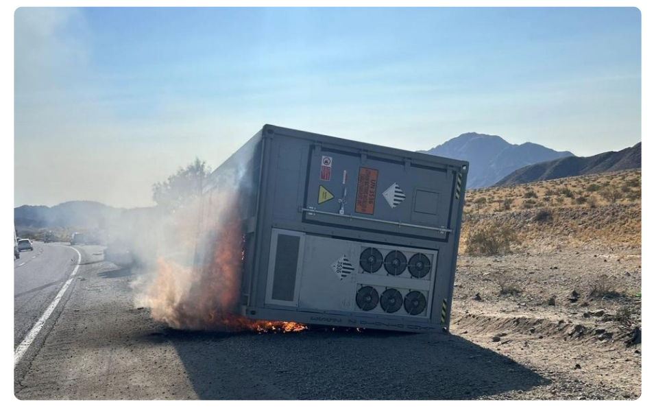
A big rig hauling lithium-ion batteries overturned and caught fire, prompting a full closure of the 15 Freeway between Barstow and Baker on Friday, July 26, 2024.

The burning batteries posed multiple threats, San Bernardino County Fire Protection District officials said.