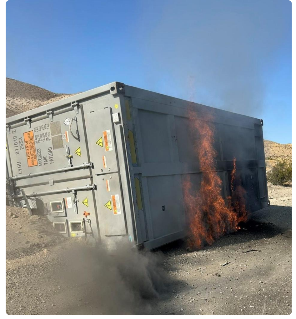
A big rig hauling lithium-ion batteries overturned and caught fire, prompting a full closure of the 15 Freeway between Barstow and Baker on Friday, July 26, 2024.

Numerous triangular yellow placards displaying lightning bolt symbols to warn of electrical danger could be seen adorning the burning trailer.